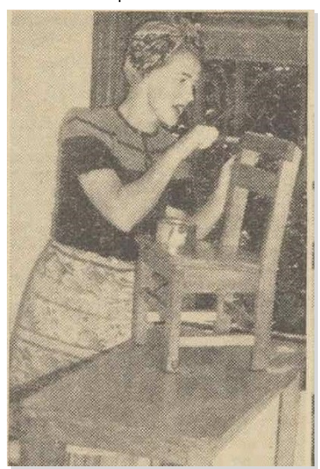
Working bee - a member of the Mosman Nursery Committee painting children's furniture for the new Nursery School, The Australian Women's Weekly, 20 May 1944

Fundraising and preparing equipment were important tasks before the Nursery School could open. One of the activities