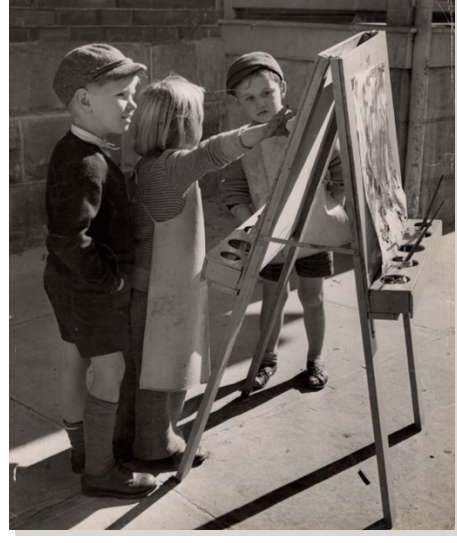
Children painting at Mosman Nursery School, 1951

The Nursery School endeavored to provide holistic education and care for