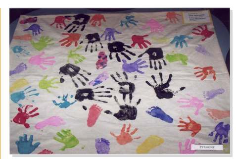
SDN's centenary celebration gift to SDN Mosman from SDN Pyrmont, 2005

SDN Children's Services runs 25 children's education and care centres throughout NSW and the ACT, as well as 23 programs supporting children and families and other sector organisations.