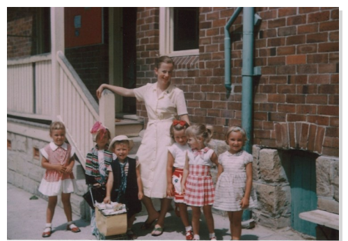
Teacher and children at Mosman Nursery School, c. 1958

organised in 1944 was a sewing bee to make bibs, face washers, towels and blankets for the little ones. Mosman Council also helped plant a garden of roses, shrubs, palms and small trees.