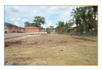
Above: The vacant site in Rooty Hill, 2010, prior to construction.

SDN's first formal disability unit was established in 1987. SDN subsequently introduced further support services: Inclusion Support Teams funded by SUPS, Child and Family Resource Centre (1997), Early Learning Program (1999) and Supporting Children with Additional Needs program (2002). When Inclusion Support Agencies were introduced in 2006, SDN became the key agency in multiple regions.