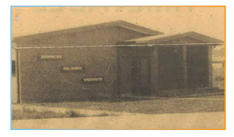
Above: Batemans Bay Pre-school Kindergarten in its first year of opening, 1975, at 1 Herarde Street. Southern Star, 23 May 1975

Due to overwhelming demand, the Association opened Day Nurseries in other locations in the inner city soon after. These were all areas of need in Sydney with large working populations.