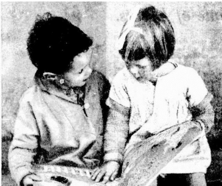
The opening of Erskineville Nursery School, on 25 August 1937, was reported in The Sydney Morning Herald the following day.

After World War II, Erskineville became a place of increasing diversity, with European migrants moving to the area to work in the many local industries.