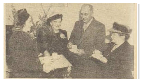
Opening of Erskineville Nursery School's new building. Australian Women's Weekly, 30 August 1947.

What hasn't changed is our vision and commitment to addressing social inequalities, improving children's quality of life and enhancing the life chances for all children.