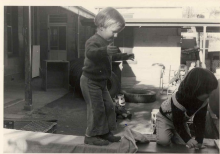
Developing motor skills and confidence, Erskineville Nursery School, 1978.

The Metropolitan Medical Officer of Health noted the purpose of nursery schools was to establish mental and physical health and creative and social interests.