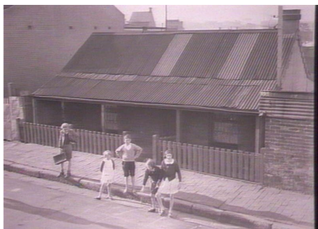
Children in the street, Erskineville, 1937.

Due to overwhelming demand, the Association opened Day Nurseries in five more locations in the inner city soon after. These were all areas of need in Sydney with large working populations.