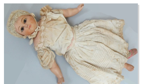
Doll (c.1900) believed to have been donated to the Nursery School by a Committee member.

What hasn't changed is our vision and commitment to addressing social inequalities, improving children's quality of life and enhancing the life chances for all children.