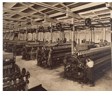
Women workers at Vicars Woollen Mills.

From its rural beginnings to its industrial heyday, Marrickville attracted those looking for employment. The early farms of the 1830s employed migrants from Europe and Asia, and with the industrial boom came workers from across the globe. By the 1970s, the suburb was attracting migrants from Southern Europe, the Middle East and Asia. As a result, Marrickville has always been multicultural, embracing its diversity.