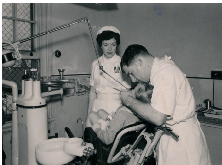
Dental room at the Sydney Day Nursery and Nursery Schools Association.

The relationship with Murrickville Council continues today, through the lease of the property. It stands as a reminder of the importance of a combined vision to improve the lives of working mothers and their children in the suburb.