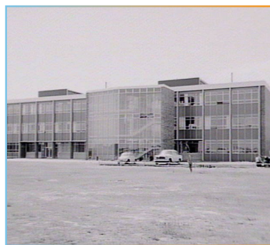
Above: UNSW at Kensington, 1961.

While UNSW's initial focus was on science and technology, today it offers courses in Arts, Fine Arts, the Built Environment, Commerce, Law, Life Sciences, Medicine and Management. The University has had a long engagement with the Asia-Pacific region and draws its diverse student body from around 120 countries.