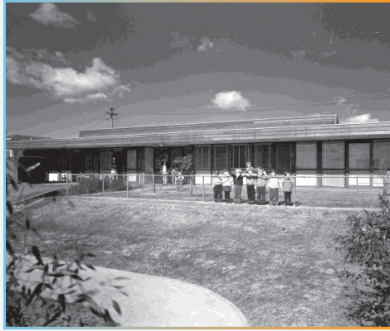
Above: House at Pooh Corner - exterior of building with children at fence 1970.