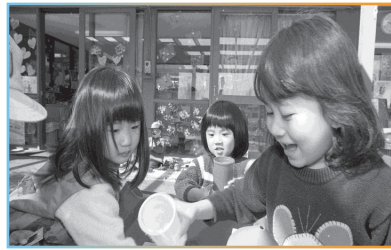
Above: Girls having fun at House of Pooh Corner, 1998.

parents and carers to assist with the daily cleaning of the centre in return for reduced fees. The waiting list continued to grow, which was testament to the high-quality service being offered. The demand for onsite childcare became so great that the Student Guild arranged for a childcare centre in nearby Coogee to take some of the children on THPC's waiting list.