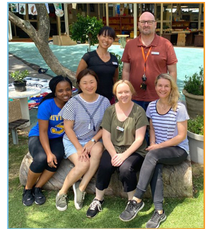
Above: SDN House at Pooh Corner staff taken on the first week of operation under SDN management in January 2021

Like UNSW Early Learning Centres, SDN's qualified team facilitates innovative, child-centered and child-led learning programs in a safe, healthy and stimulating context. These centres help all children to develop a lifelong love of learning through activities and teaching approaches that nurture caring hearts, healthy bodies and curious minds. The House at Pooh Corner remains on UNSW's Kensington Campus overlooking the Village Green. A perfect green space to explore and grow.